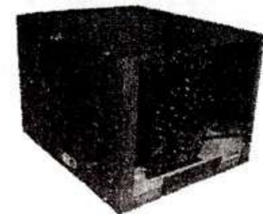
Horizontal "A" Coil